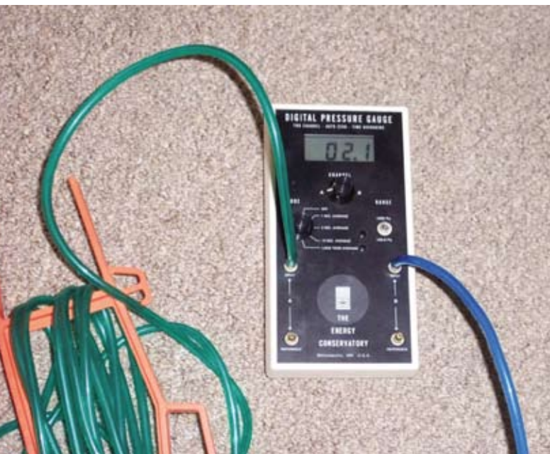
Figure 1 – A two-channel micromanometer.

In larger buildings there is a great advantage to simultaneously measuring the pressure difference between indoors and outdoors at several locations or between floors and zones. This gives immediate feedback on the effect wind, stack and interzonal airflow resistance is having on the pressure differences across all walls. Recording the data allows later analysis when data points with the smallest differences between orientations can be used. An eight channel micromanometer from the Energy Conservatory is shown in Figure 2 . For this test four of the channels measure the pressure difference across four wall orientations, one channel measures the pressure difference between first and second floor and