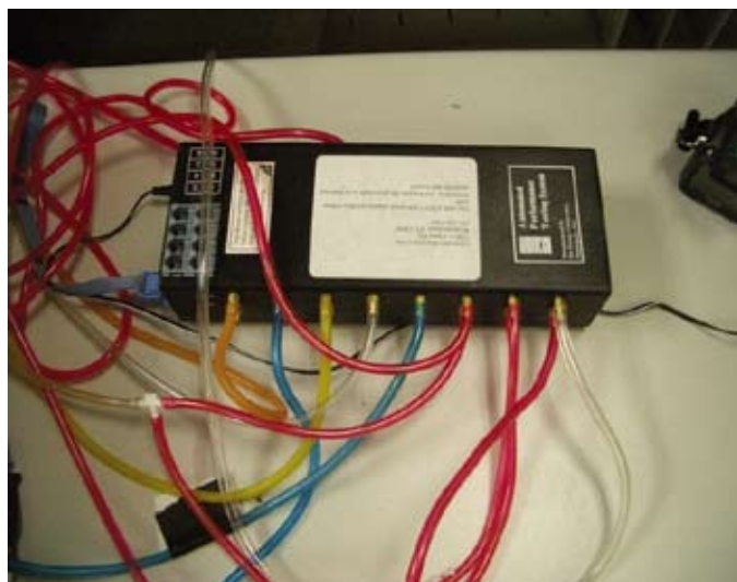
Figure 2 – An eight channel pressure difference datalogger.